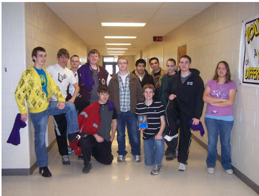
Lockport Township High School students participate in the Illinois Drafting Educators Association (IDEA) regional competition held at Joliet Junior College.

CAD/Drafting students from twelve schools from Three Rivers Education for Employment System (TREES) attended this year’s regional competition. At the competition, students were given a drawing problem to solve and draw in a two-and-half-hour time limit. The designs were graded by architects, engineers, and college instructors.